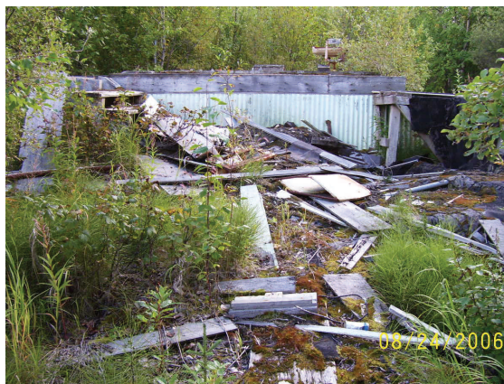
Old School Site Possible Phase I Assessment to be conducted during fall, 2007

Although the majority of meth sold in the U.S. is produced in Mexico and Cali-