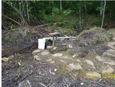
Natural Freshwater Spring located at Anvik Anvik Park (August, 2006)

If lead-acid batteries are disposed of in a solid waste landfill or illegally dumped, the lead and sulfuric acid can seep into the soil and contaminate ground water, potentially affecting the quality of our drinking water supply. If the batteries are disposed of near rivers, streams, lakes, or marine wa-