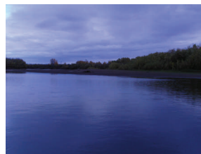
Fall time on the Anvik River September, 2006

Request for Proposals were released and advertised, for the Old AVEC Site, in the Anchorage Daily New, Fairbanks Daily News Miner, Tundra Drums, and the Delta Discovery. BTRP Staff will be